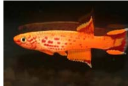
Far Right: Aphyosemion Gardneri