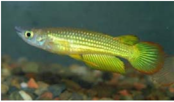
Above: Giant Gold Panchax