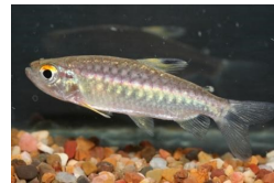
Bottom right: Red Eye Characin