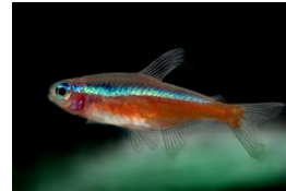
Top right: Cardinal Tetra