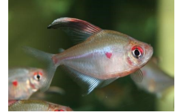
Middle right: Bleeding Heart Tetra